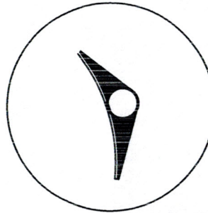
X4 Hoisting/Tie Down Handles

6" Inlet- All septic tanks include a 6"x4" Fernco Reducer boot. Alows for flex durning settling