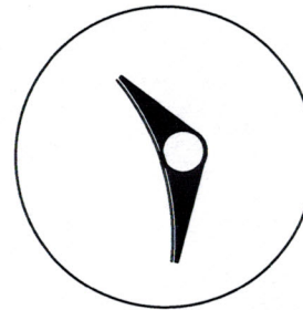
X4 Hoisting/Tie Down Handles